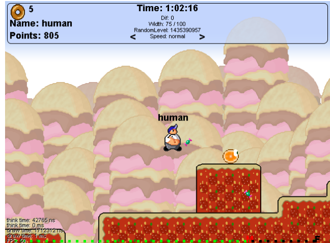
Figure 1: Screenshot of ApoMario.